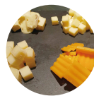
Semi Hard & Hard Cheese